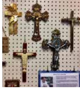
Just a few of the cross in St. Anne's Bookstore