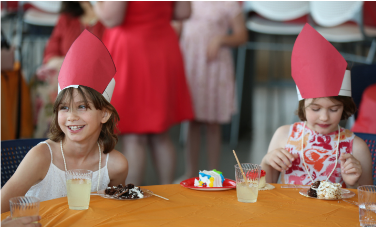
All Saints' youth on Pentecost 2023.