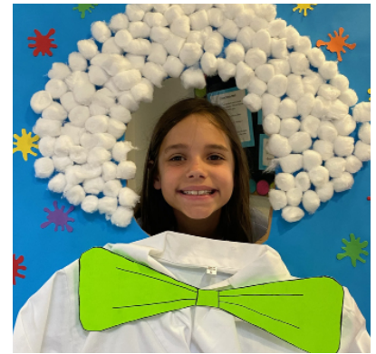
VBS Campers during VBS 2023