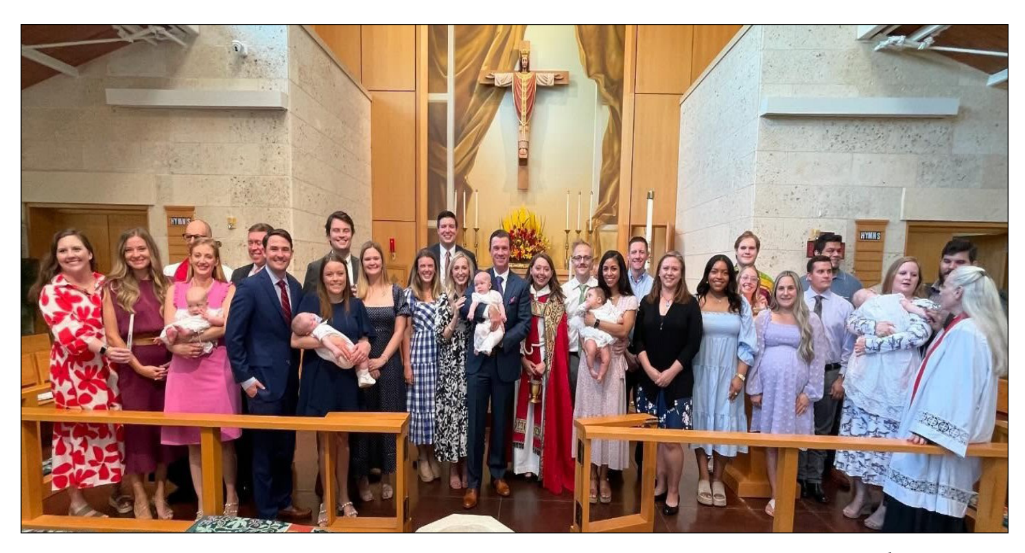
Pentecost, 2024 - Read more on Page 3.