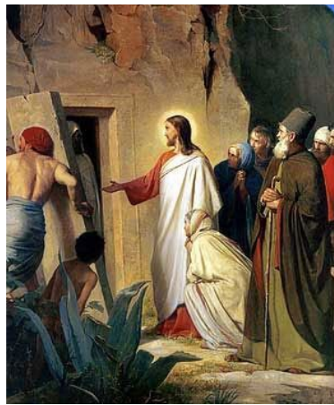
The Raising of Lazarus by Carl Henrich Bloch, 1870

After the Gospel: Praise be to thee, O Christ.