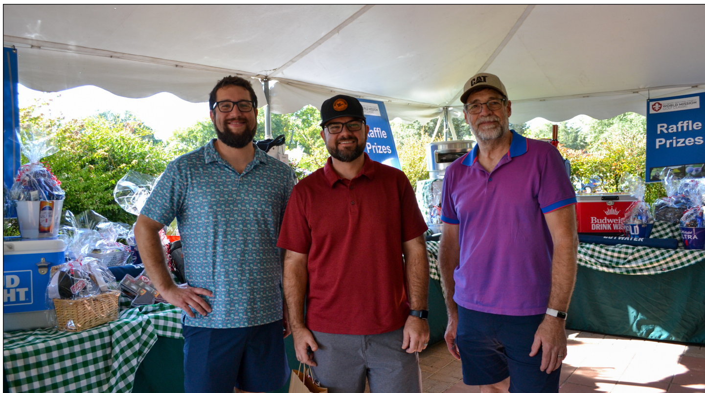
14 th Annual World Mission Golf Classic, 2024 - Read more on Page 1.