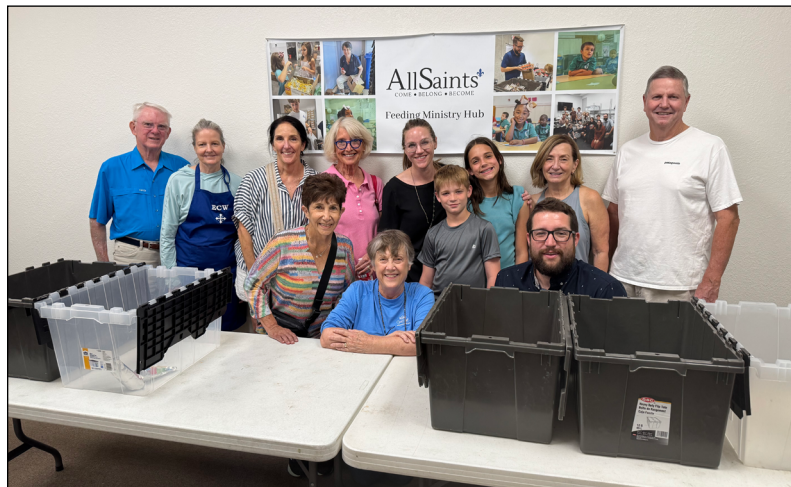
Food Packing - Sunday, September 28