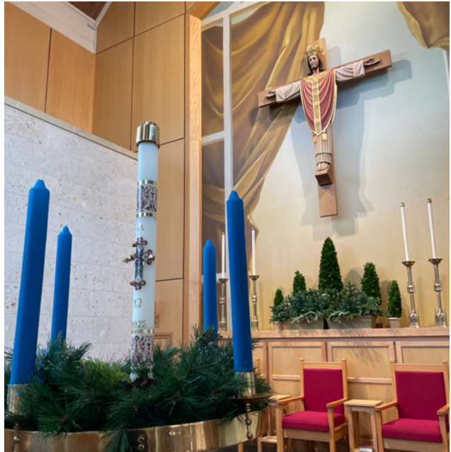
The Advent Wreath in the All Saints School Chapel