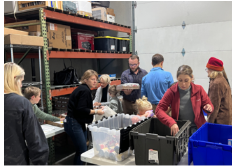
Parishioners packing food for Como