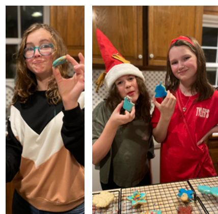
The EYC baking Advent cookies