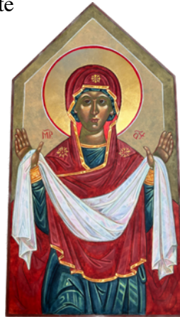
Example of a handwritten icon.