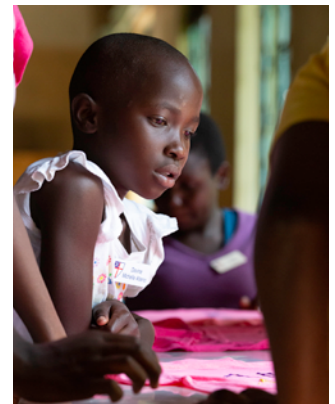
Did you know? It only takes $5.26 to support an Amazing Grace Girl for a day.