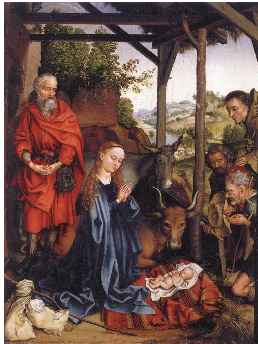
Nativity , Martin Schongauer (c. 1480), from Art in the Christian Tradition , a project of the Vanderbilt Divinity Library, Nashville, TN.

The Rector, Vestry, and Rector's Staff wish you a blessed and joyous Christmas season!